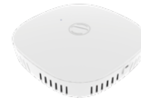
Wi-Fi 6 Access Point