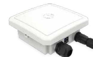
Wi-Fi 6 Access Points