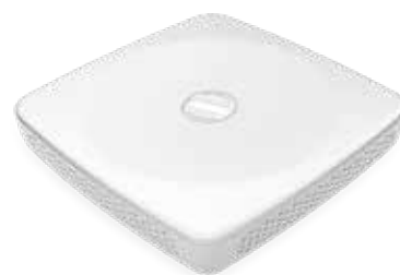
Wi-Fi 5 Access Point