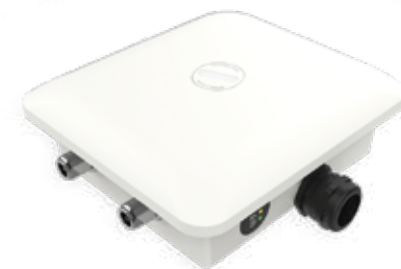
Wi-Fi 5 Access Point